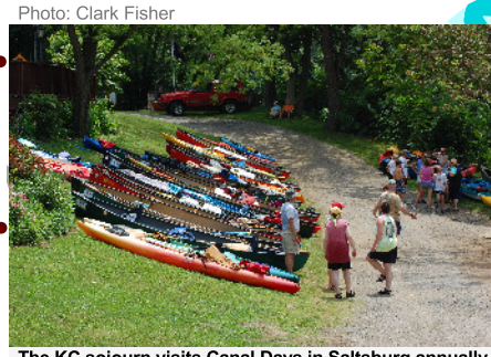
The KC sojourn visits Canal Days in Saltsburg annually

This map is designed to accompany its legend, access directions, points of interest identification, map blow-ups of towns, caution information, and general area information which can be downloaded and printed from: www.mainlinecanalgreenway.org